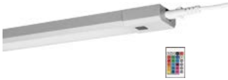
1 LINEAR LED Slim RGBW 500