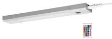
2 LINEAR LED Slim RGBW 300