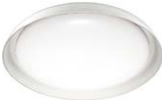
1 SMART+ WIFI ORBIS Plate 430 WT