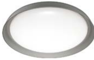
2 SMART+ WIFI ORBIS Plate 430 GR