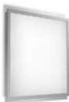
2 PLANON PLUS 600x600 36 W 3000 K