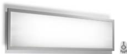
3 PLANON PLUS 300x1200 30 W