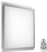
4 PLANON PLUS 600x600 30 W