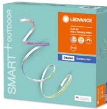
1 SMART+ BT FLEX