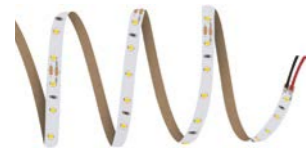
Prewired cables on both sides

LED strips with 1400 lm/m for general applications