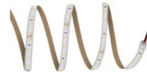
Prewired cables on both sides

IP65 protected LED strips with 1400 lm/m for general applications