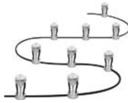
2 SMART+ WIFI GARDEN 9 Dot