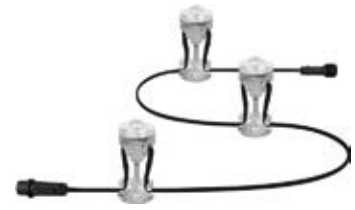
3 SMART+ WIFI GARDEN 3 Dot extension