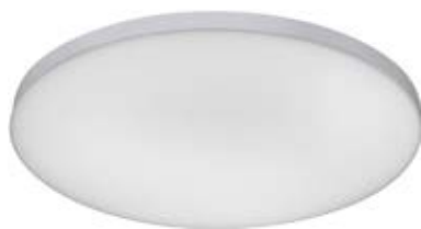
1 SMART+ WIFI PLANON 450