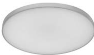
2 SMART+ WIFI PLANON 300