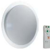
1 ORBIS Sparkle 600 38 W 2800-6000 K