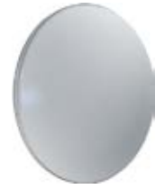
3 ORBIS Sparkle 450 24 W 3000 K