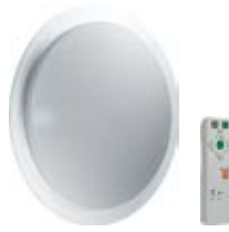
2 ORBIS Sparkle 500 28 W 2800-6000 K