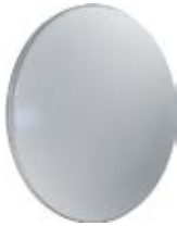
4 ORBIS Sparkle 450 24 W 2700-6500 K