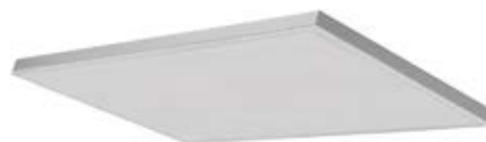
3 SMART+ WIFI PLANON 600x300